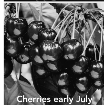
Cherries early July