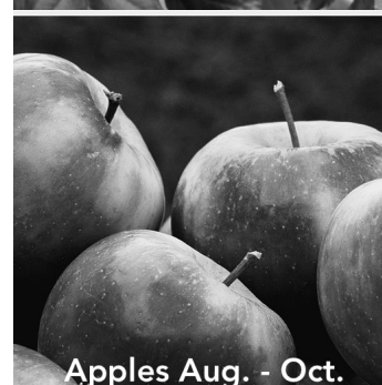
Apples Aug. - Oct.