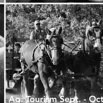
Ag. Tourism Sept. - Oct.