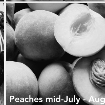
Peaches mid-July - Aug.