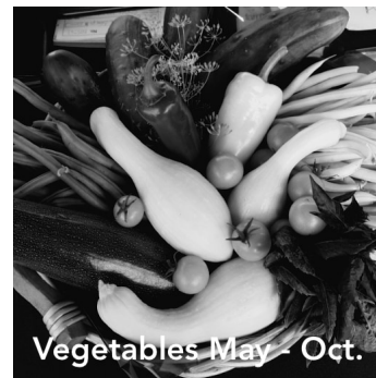
Vegetables May - Oct.